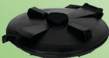
16" Lockable Hinged Lid w/ vent