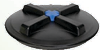
16" Standard Lid w/ vent